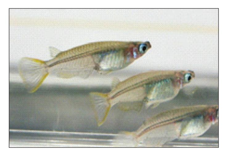
Figure 1. Javanese medaka Oryzias javanicus . It was obtained from National Bioresource Project Medaka (NBRP) in National Institute for Basic Biology, Okazaki, Japan. Most Oryzias species have relatively flat back, perhaps reflecting their surface swimming habitat, and a small dorsal fin locates near the tail fin.

Another two species, Javanese medaka O. javanicus (Fig. 1) and the Indian medaka O. dancena are becoming popular especially in the